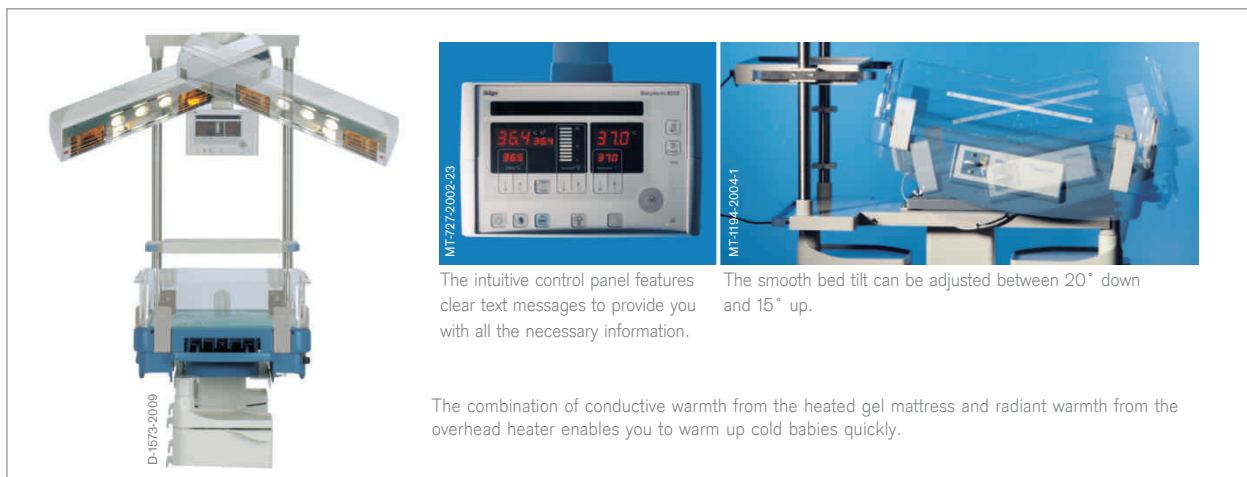
The intuitive control panel features clear text messages to provide you with all the necessary information.

The soft feel and soothing comfort of the actively heated gel mattress, that comes standard with the BabyTherm 8000* and 8010, add to the controlled thermal environment to make your little patient feel considerably more comfortable. By using the heated gel mattress, you can reduce the output from the radiant heater, which in turn reduces insensible water loss. In addition, the combination of conductive warmth from the heated gel mattress and radiant warmth from the overhead heater enables you to warm up cold babies quickly.