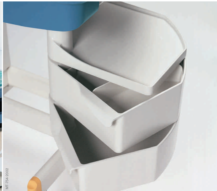
The swivel drawers provide plenty of space for storage.