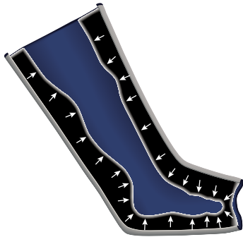
Consistent Inward Pressure

Overlapping internal chambers eliminate uncomfortable 'pinch points'.