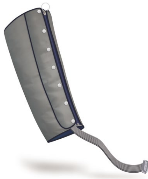
Twelve Chamber Arm Garment

Clinical evidence - Intermittent Pneumatic Compression (IPC) and Manual Lymph Drainage provides a synergistic enhancement of the effect of Complex Decongestive Physiotherapy (CDP).