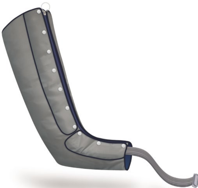
Twelve Chamber Leg Garment