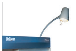
Halogen lamp For workplace illumination.