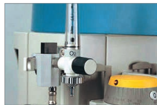
Auxiliary Oxygen Therapy featuring O 2 therapy, supplied by Primus gas delivery.