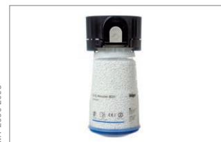
Dräger CLIC system New Clic system for easy exchange of soda lime during operation.