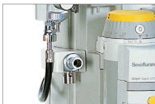
External Fresh-gas outlet for connection of semi-open breathing systems.