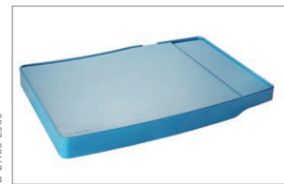
Large Writing Trap This writing tray can easily be mounted and it fits A3 paper format.