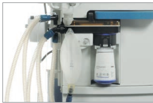
Compact Breathing System Easy to mount and disassemble breathing system with integrated heater.